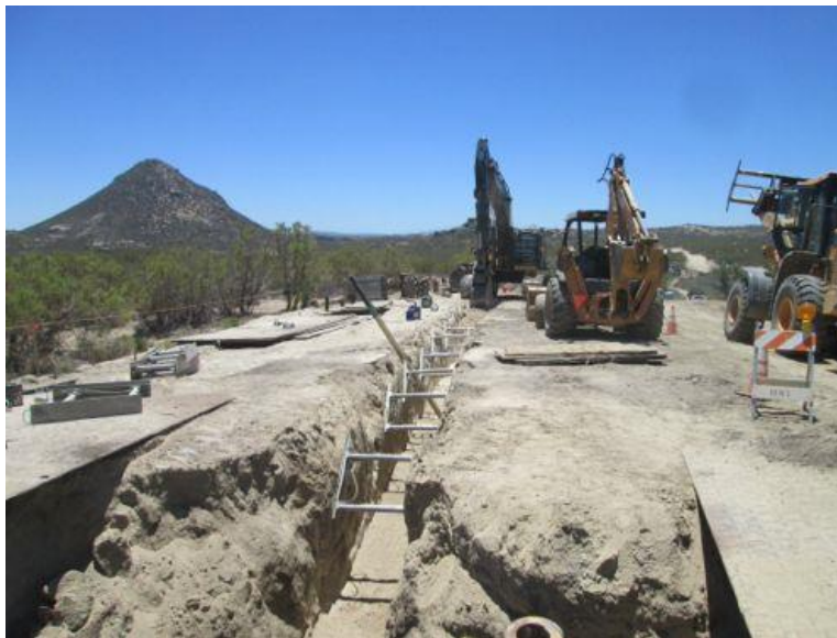
Photo 4: Trenching for the underground utilities included exporting soils offsite to the Domingo Lake Construction Yard.