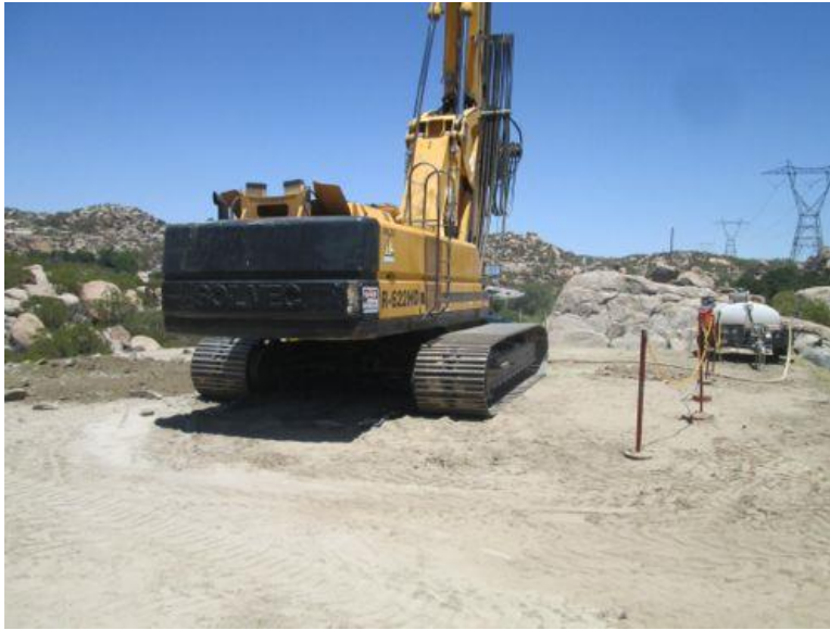
Photo 3: Visqueen was observed staged beneath vehicles in accordance with the SWPPP and MM-HYD-1.