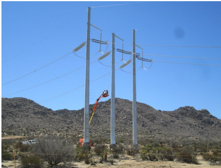
Photo 6: Crews were observed installing spacer carts at the SWPL overhead transmission line.