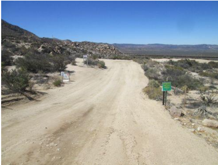
Photo 5: Signage indicating approved access road and speed limit restrictions were observed in-tact and installed along the project.