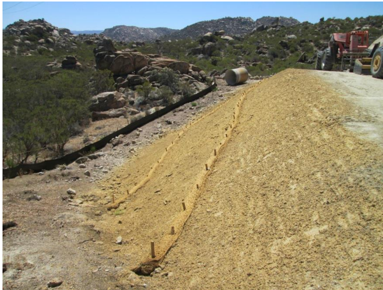
Photo 2: In accordance with the BIO1-d and the Habitat Restoration Plan, pad fill slopes are sprayed with hydro mulch in an effort to reduce soil erosion. Erosion control measures consisting of straw wattles, silt fence and gravel bags are being maintained in accordance with the SWPPP and MM-HYD-1.