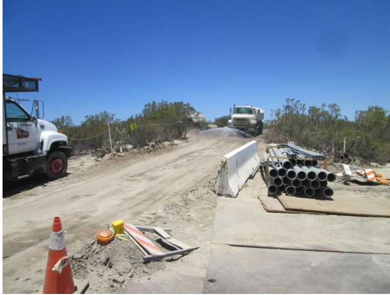
Photo 1: Water trucks were observed applying water to project access roads to minimize potential for fugitive dust in accordance with MM AQ-1.